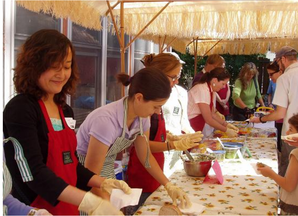
Volunteers help us in myriad ways; here they prepare tomato sandwiches for one of our special community events.