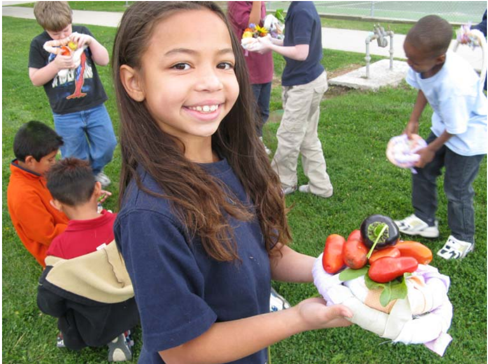
Children in our program showing off the plant-dyed fabric baskets they created and filled with fresh vegetables.