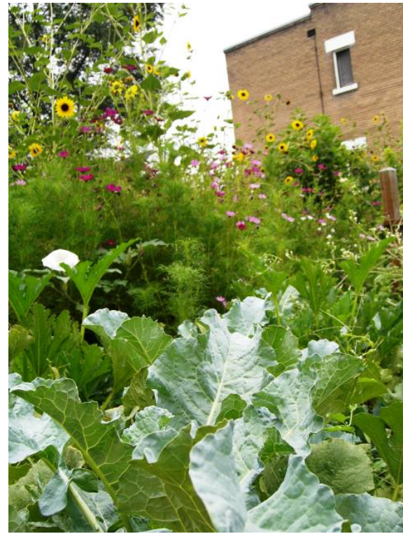
The lush and verdant 4th East Garden in bloom.

WCG would like to extend a special thanks to the Mayor and City Council, and the City's Open Space Lands Program, for providing half of the funds to make the purchase possible. And of course, a huge thank you to absolutely everyone who donated their time, money and energy to save the 4th East Garden for generations to come!