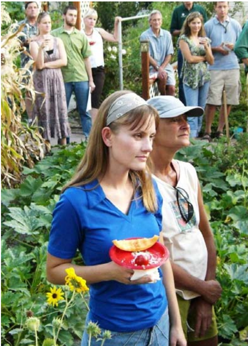
Gardeners and friends gather to celebrate this special place.

Over the years, the garden yielded thousands of pounds of fresh, healthy and delicious food, and it was a welcome sight of flourishing urban agriculture for neighbors and passers-by. As a community in itself, the garden provided opportunities for leadership and exchange among diverse individuals who otherwise would not have met.