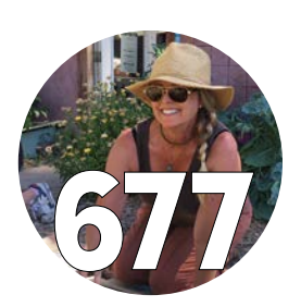
COMMUNITY MEMBERS attended one or more workshops

COMMUNITY GARDENERS participated in a workshop in their garden