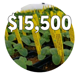
WORTH OF ORGANIC PRODUCE grown at the farm was consumed by program participants and donated to other WCG programs and nonprofits serving lowincome individuals and families