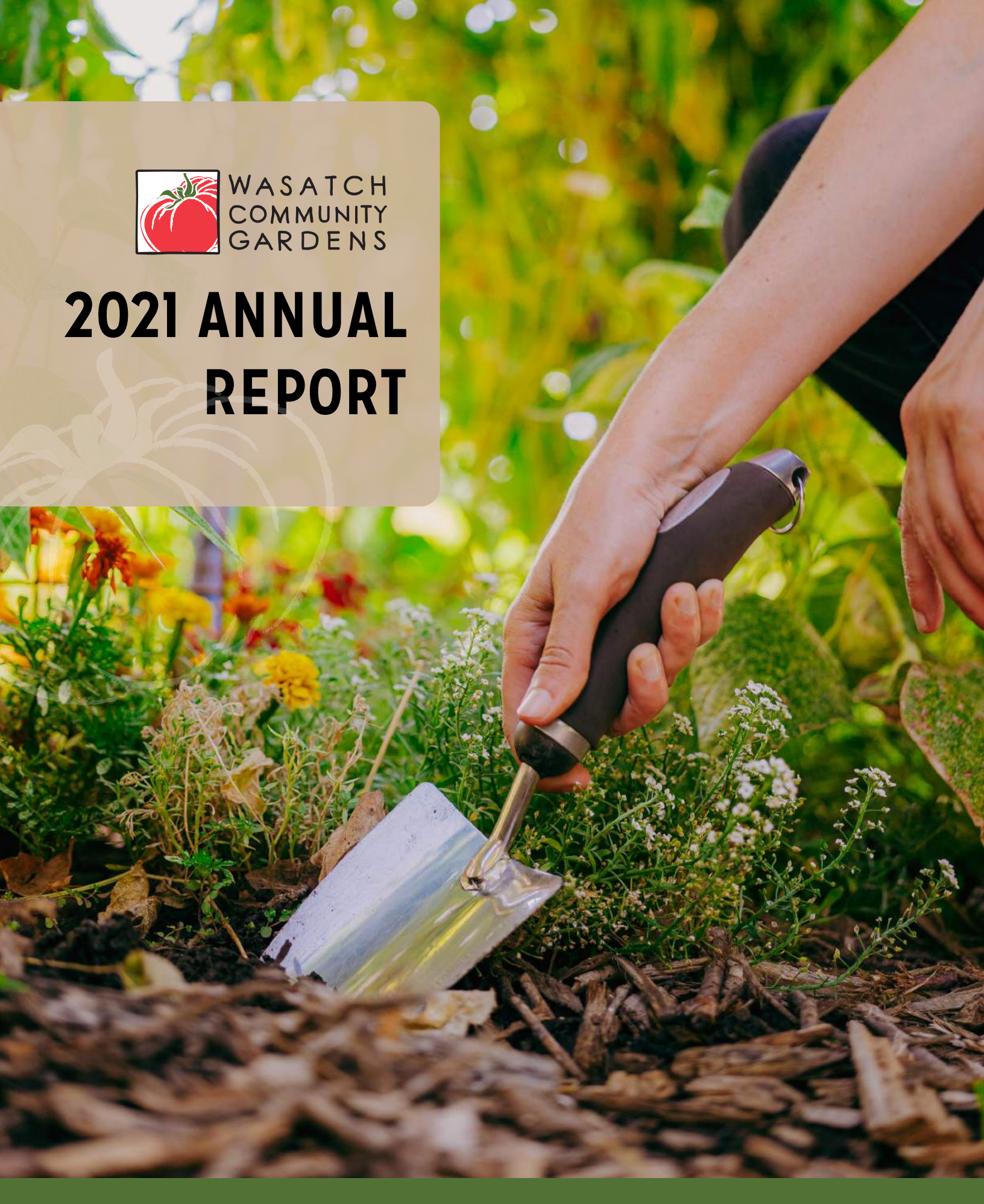
Empowering people to grow and eat healthy, organic, local food.